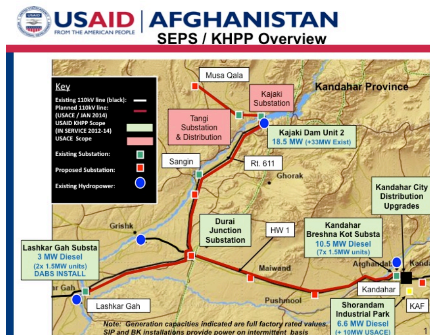
Figure 2 Map of Kandahar-Hilmand Power Project circa 2012