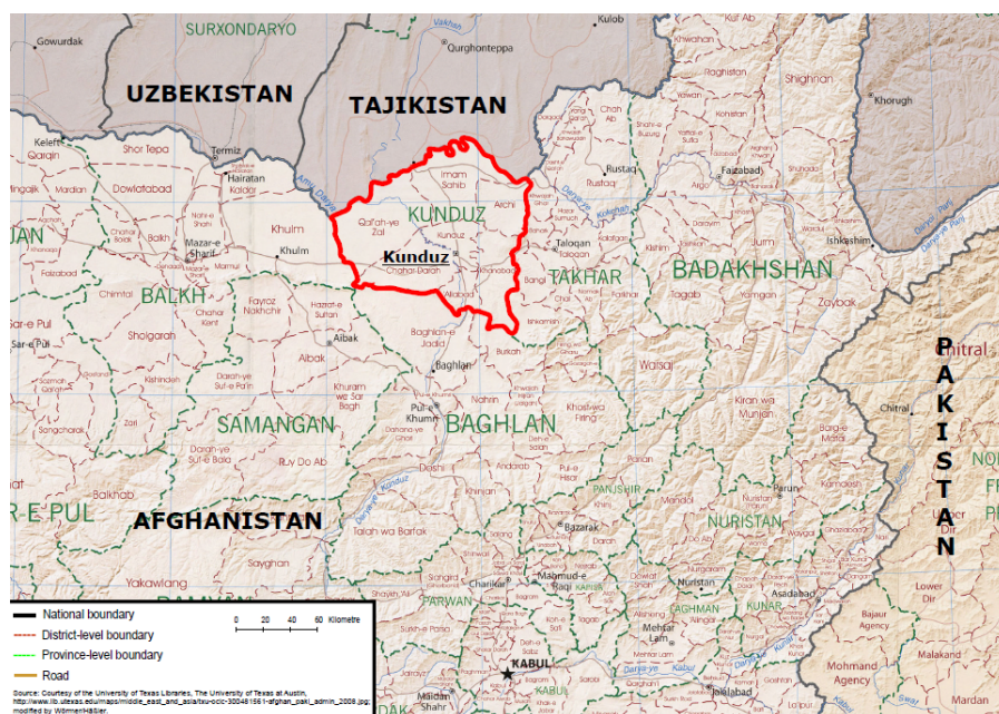
Kunduz , northern eastern

were made during the very first phase of the mission. They still have a great negative impact on the current situation. One major failure is, as General Stanley McChrystal stated, that 'even now the military lacked sufficient local knowledge to bring the conflict to an end.' 15 Furthermore he admitted that 'we didn't know enough and we still don't know enough. Most of us, me included, had a very superficial understanding of the situation and history, and we had a frighteningly simplistic view of recent history, the last 50 years.' 16 The following section includes a paragraph dealing with available sources and literature on the history of Kunduz and also briefly assesses the few booklets and other information material German soldiers or civilian personnel receive when preparing for a mission in Afghanistan's northeast.